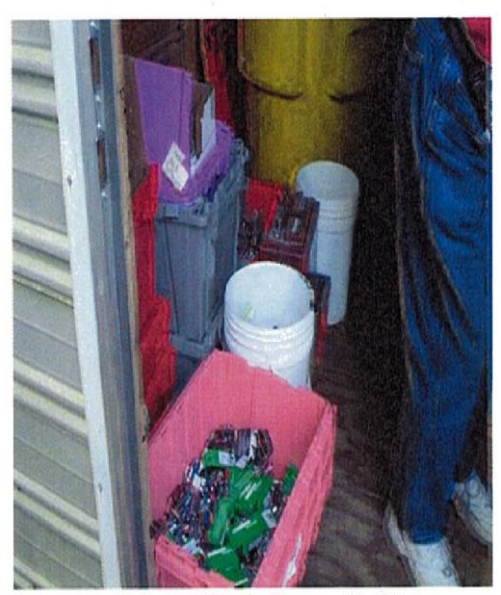
Picture 10 - Universal Waste Storage Shed#1 – Storage of open, unlabeled and not dated containers of spent alkaline, lithium and lead acid batteries