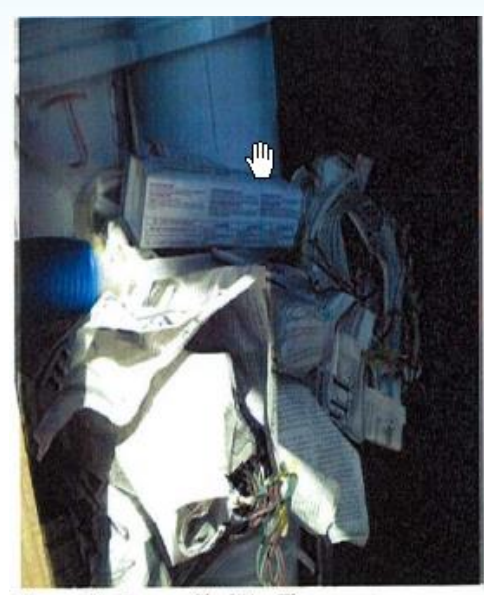
Picture 24 - Storage Shed#4 - Three spent mercury bulbs on top of Non PCBs ballasts.