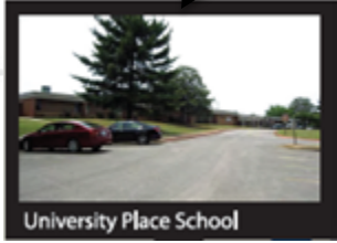
University Place School